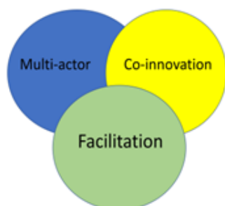
Figure 1. The three concepts addressed in the training course