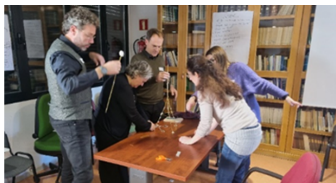
Figure 2. Participants practicing multi-actor co-innovation.

Training was highly participatory , and trainees engaged in the discussions and small group tasks to share experiences and move collectively towards shared understandings . Important contributions by the trainees were captured throughout the session by using flipcharts while the participants worked together in an open, trusting, and constructive environment which they had agreed to from the outset (Figures 2 and 3).